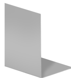
GREENFOND LLK łącznik listwy krawędziowej